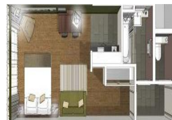
Studio floor plan