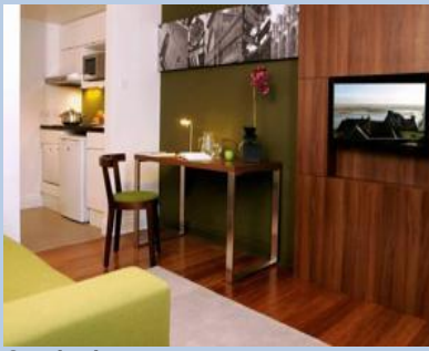
One bedroom apartment