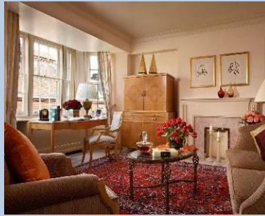
One bedroom apartment