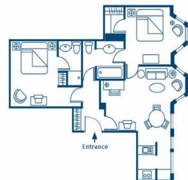
Two-bedroom floor plan