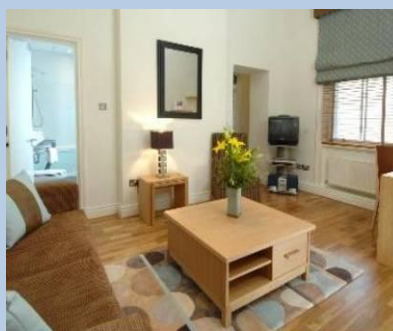
One bedroom apartment