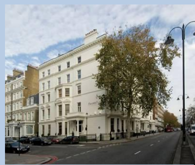
Fraser Place building